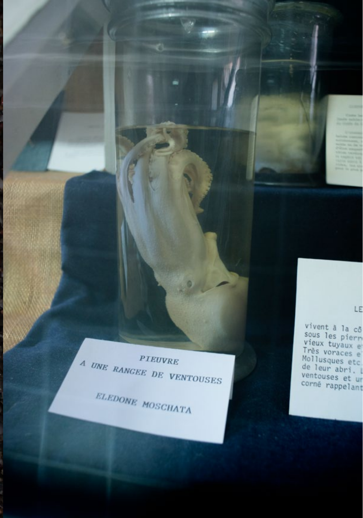
PIEUVRE A UNE RANGEE DE VENTOUSES ELEDONE MOSCHATA

LE vivent à la cô sous les pierr vieux tuyaux g Très voraces e Mollusques etc de leur abri. L ventouses et un corné rappelant